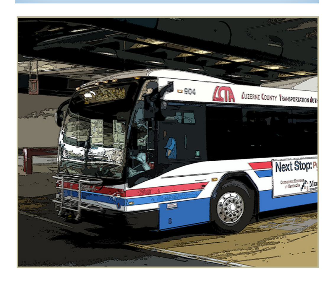
Transit Consolidation Study SUMMARY REPORT