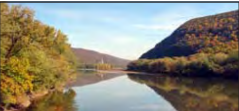
Conservation Area must be preserved throughout the two-county area.

Conservation Areas include sensitive environmental features, scenic landscapes, agricultural lands, as well as recreational sites and other cultural resources. Except for agricultural, recreational, and resource-based enterprises, there should be no new commercial or industrial uses in these areas.