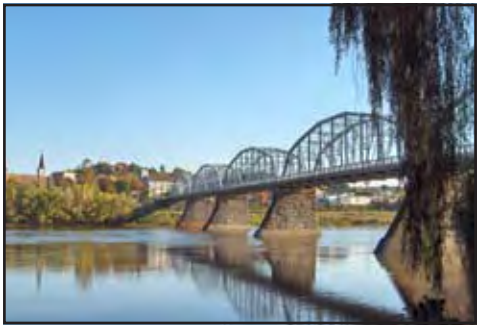
Bridge over the Susquehanna River in Pittston

The intent of the Land Use Plan ( see map ) is to provide an efficient and economical way to allow for both new growth and revitalization, meet a diversity of needs, support transit, reduce consumption of open space, and protect environmentally-sensitive resources. The Land Use Plan is a guide for development and redevelopment in Lackawanna and Luzerne Counties through the year 2035. It is based on the moderate rate of growth projected to occur over the planning period, including an additional increase in population of approximately 35,000 people (568,000 total) and a net gain of 24,000 housing units. Recognizing current development trends and the importance of reinvestment along the Lackawanna and Luzerne County valleys and in urban centers, the Land Use Plan is built around ‘smart growth’ and sustainability principles.