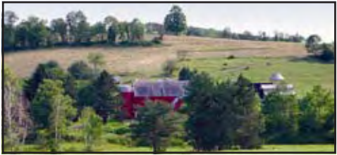
Strategies to strengthen the agricultural community need to be pursued.

Priority and Infill Areas in some cases coincide with locations that have been disturbed by mining activities. These places are clearly appropriate for a designation as highest priority for reclamation. The Regional Plan emphasizes the reclamation of mine spoils for development areas for future industrial, commercial, residential, and open space uses.