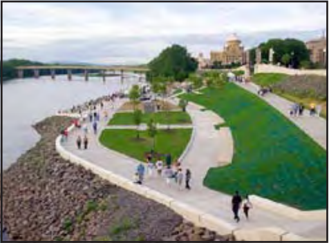
Newly renovated waterfront in Wilkes-Barre

The LRTP serves as a resource to guide the wise use of public funds in the investment of a transportation system, so that cost-effective infrastructure that will efficiently move people and goods throughout the region will result.