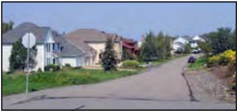
The region has many stable suburban neighborhoods.

The Housing element explicitly recognizes the division of each county into Priority and Mixed Density Infill Areas for housing growth and Conservation Areas as the non-growth portion of the region. Priority Areas represent significant opportunities to develop and redevelop properties for mixed uses, including residential components. Parcels in these areas are suitable for higher-density residential uses, such as multi-family (apartment) and single-family attached (townhouse) units, and specialized residential uses such as life-care facilities. Infill Areas provide opportunities for new development and redevelopment on properties that are vacant or underutilized. New development or redevelopment of these areas will provide opportunities for new or rehabilitated housing stock to be built using green building principles and both counties will encourage environmentally-friendly housing construction.