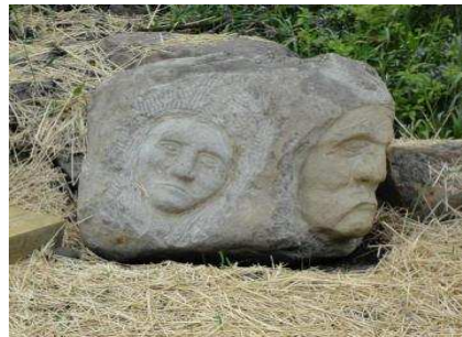
Rock carvings found along the trail

The CNJ extension begins at Elm Street, not far from the South Side Shopping Center, and offers trail users the opportunity to travel to Taylor along the former rail line,