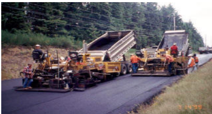
Example of echelon paving technique

Work on the project is slated to begin this spring and take two construction seasons to complete. The anticipated cost is $9.6 million, with the split being 80% federal and 20% state.