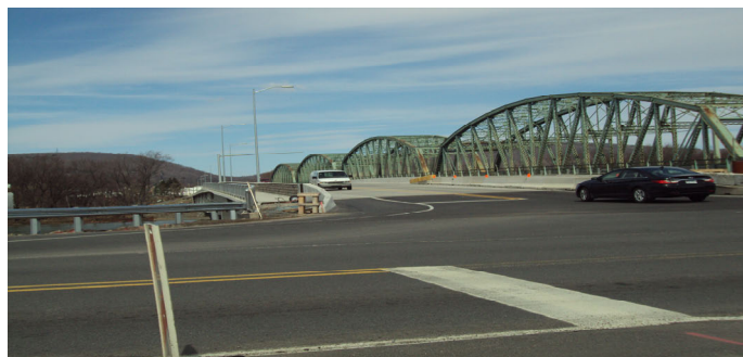
Cars exiting and entering the new bridge